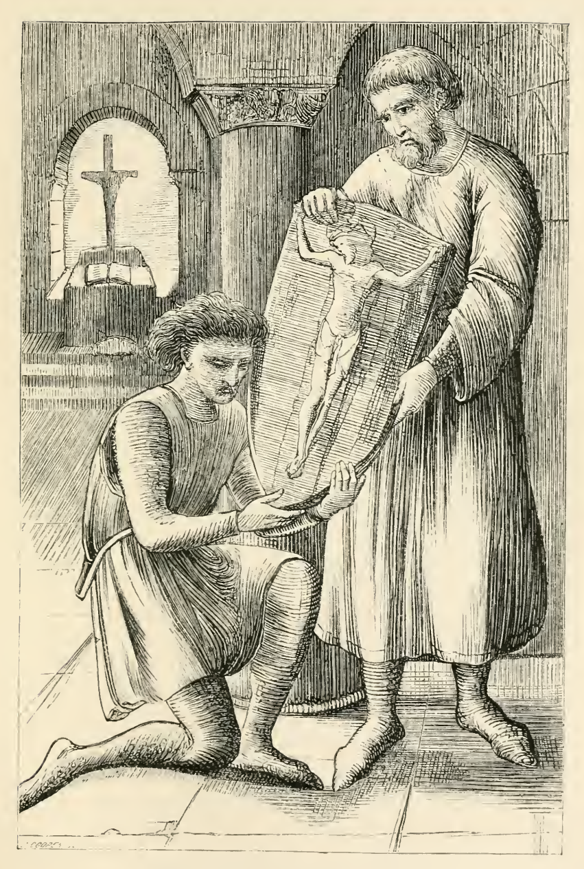
Thangbrand gives his shield to Olaf. - P. 180.